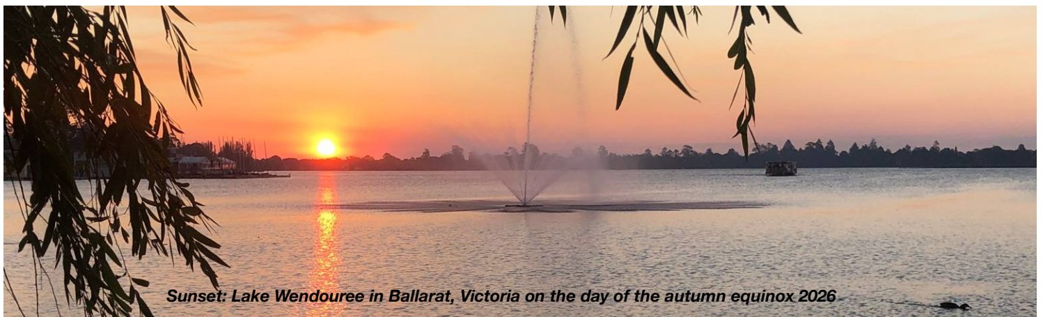
Sunset: Lake Wendouree in Ballarat, Victoria on the day of the autumn equinox 2026