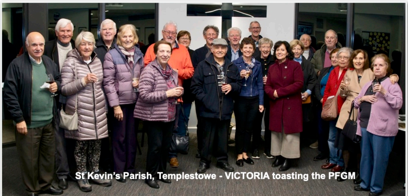
St Kevin's Parish, Templestowe - VICTORIA toasting the PFGM

Mass was followed by a social get-together, providing the opportunity for members to mingle with other parishioners and also to view photos from over the years.