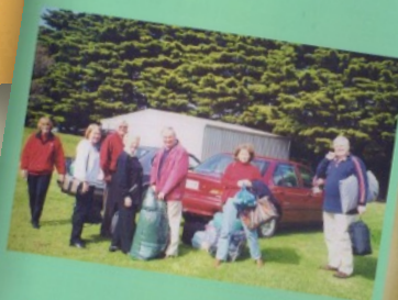
Greyfriars, Mt Eliza, October 2001