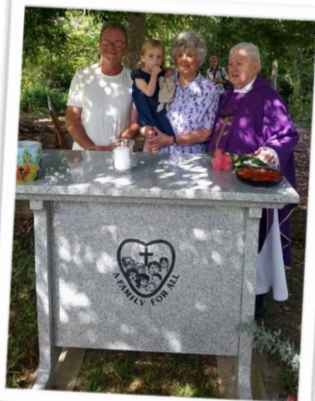
Blessing the new outdoor altar at St Anthony in the Field Catholic Church, Terry Hills (Note the Passionist Family Group Logo)