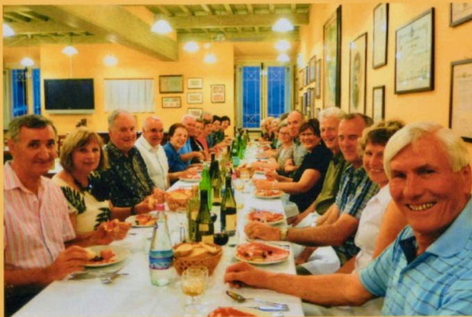
O'Brien Group 1993 - 2019

May the faith and support of the Passionist Family Group Movement guide us forward