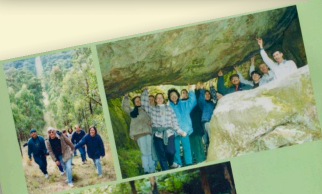
Romsey, June 1995

*We would like to include stories and photos from your Family Group. Please send your contributions to pfgm.victas@gmail.com