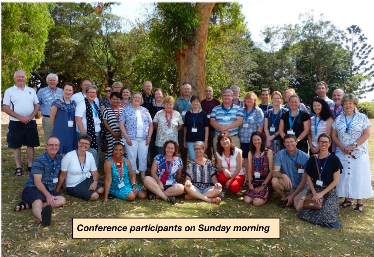
Conference participants on Sunday morning