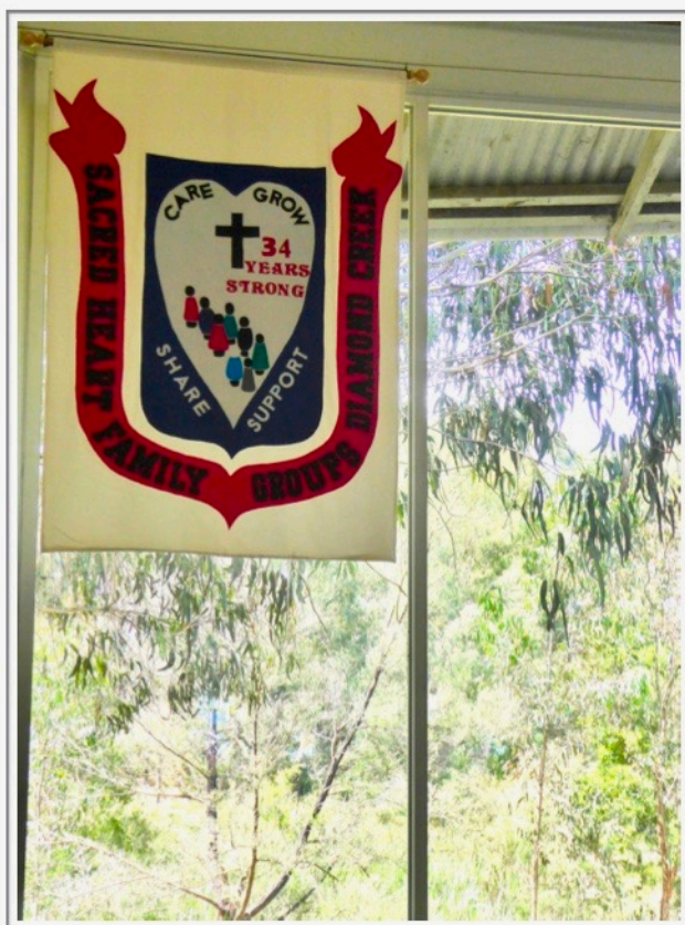
Celebrating 35 years on 2020.

The Diamond Creek Parish of the Sacred Heart was one of the first Victorian parish to embrace the Passionist Family Group Movement in 1985. Almost 35 years later, its banner hangs proudly in the church against a background of beautiful eucalyptus leaves.