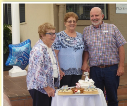
Burleigh Heads Family Group members celebrate their 21st Birthday